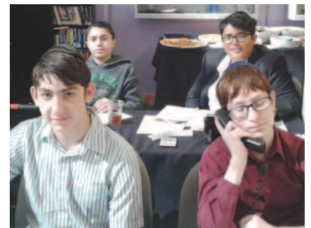
▲ FEDERATION PHONE-A-THON