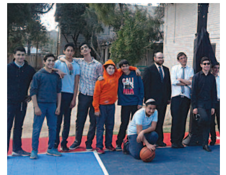
▲ LEARNING & BASKETBALL WITH PHA 8TH GRADERS