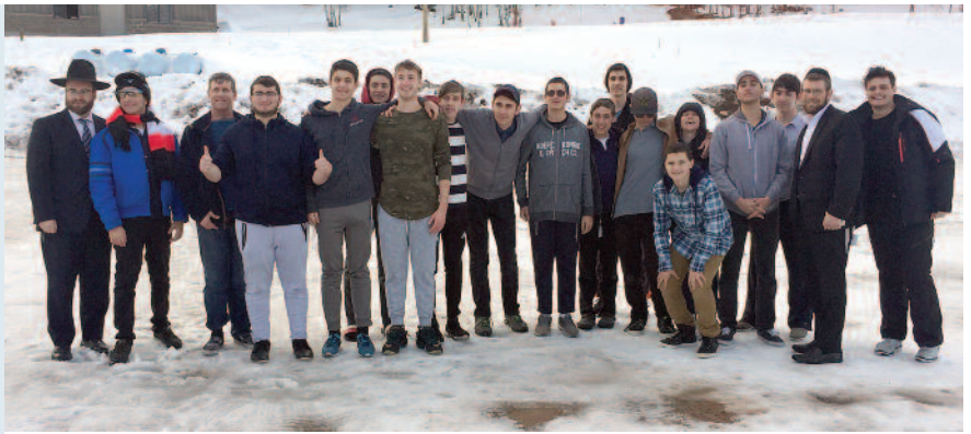
▲ SKI TRIP FOR EXEMPLARY SHACHARIS ATTENDANCE